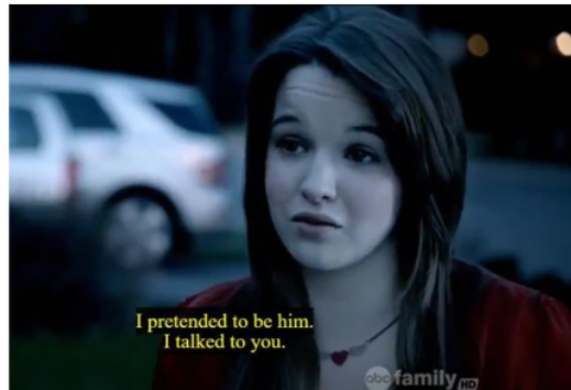
Figure 6. Samantha admitted her mistake

Samantha admitted the bad thing she did to Taylor that she was the one who created James's account, talk to Taylor, pretended to be James, and also told everyone that Taylor gave him STD. Taylor who heard that was sad and shut herself in her room. Samantha's actions were Cyberbullying because she created an account named James and helped spread rumors using her Cliquestres account. On the other hand, Taylor's Impact is Poor social adjustment because she showed solitude and locked herself in her room.