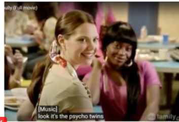
Figure 7. Lindsay still mocking Taylor

Lindsay mocked Taylor and Samantha in the cafeteria. Taylor who returned to school accidentally met Samantha and asked her to sit together in the cafeteria, but when she was looked for a seat, Lindsay and her friends again said ugly nicknames, she also made fun of Samantha knowing that she is pretend to be James, so that Lindsay said "Look it's the psycho twins" . Taylor was angry and could not stand Lindsay's taunts towards her and immediately turned to Lindsay's place and advised Lindsay to stop saying obscenities, hurtful word and stop attacking people in Cliquestres.