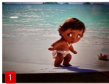
Figure 2. There was a Turtle's child want to go out, but blocked by birds (super-ego)