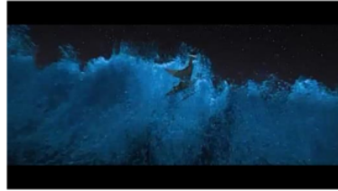
Figure 4. The big wave hit Moana’s boat and Maui

Moana : “Yes, we will!” Maui : “ Turn around! ” Moana : “No!”