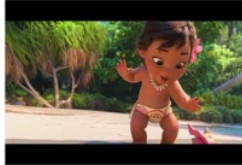
Figure 1. Moana want to took the beautiful trumpet shells (id)