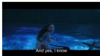
Figure 7. Moana crossed the sea for her grandma and for her people (ego)

In this scene, Moana's grandmother fell sick. Moana felt pity when she saw her grandmother helpless. There are few dialogues between Moana with the grandmother.