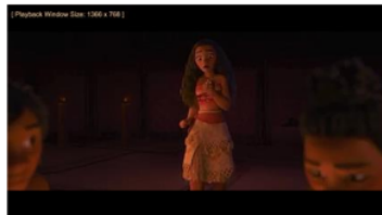
Figure 6. Moana want to accompanied her grandma who is getting sick (id)