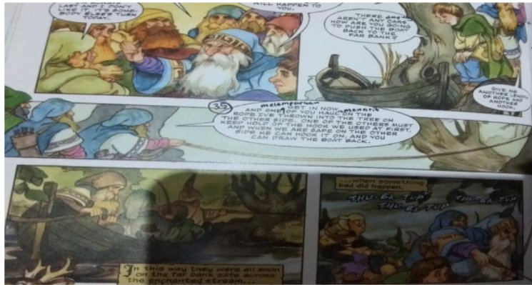
Figure 2. Part of through plot of story

The message: if we are in a good cooperation, surely it we can solve any problem